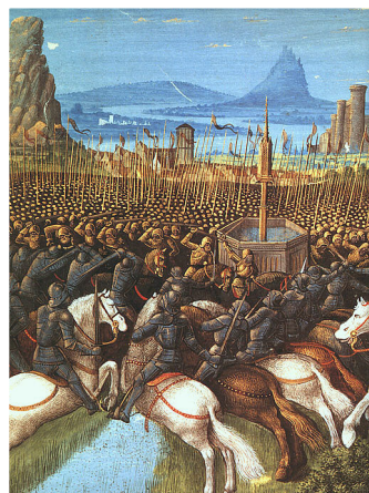
Battle of Hattin. Wikipedia