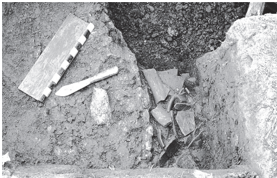
Tools at a dig site.

Clues within soil can be a guide to what has happened in history. Clues within art and literature can be a guide to how societies have viewed soil. Evidence indicates that soil has been important in deciding the success or failure of many societies through agricultural sustainability and events such as battles or political changes. Soil and people are bound to each other. If we care for the soil, the soil will care for us.