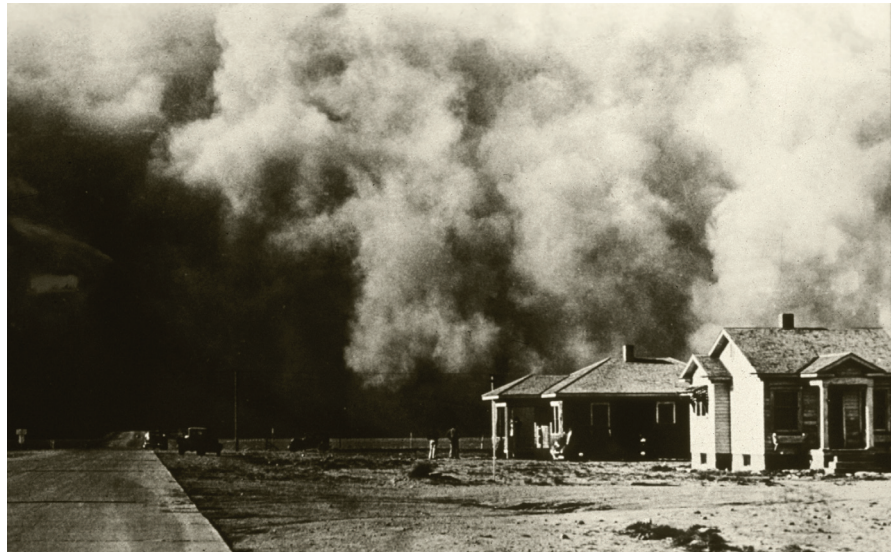
A great 'roller' moves across the land during the Dust Bowl.